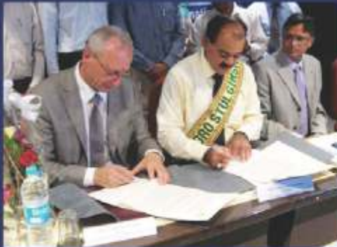
Collaboration Agreement signed between Aleksandras Stulginskis University, Lithuania and Sankara Group of Institution for Faculty/Student exchange Programme