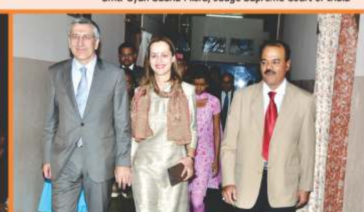
H.E. Shri Satyapal Malik, Hon'ble Governor of Bihar alongwith the VVIP's released the Special Issue of Technikon during National Level Youth Fest SITE-2018