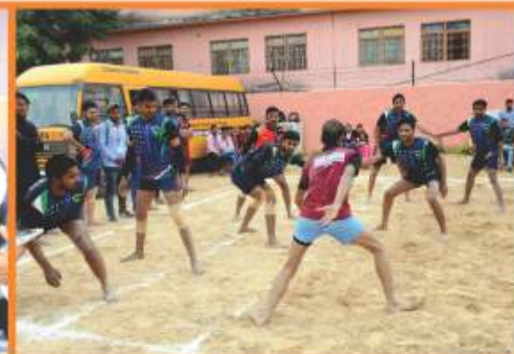
Kabaddi Match during the National Level Youth Fest SITE-2018