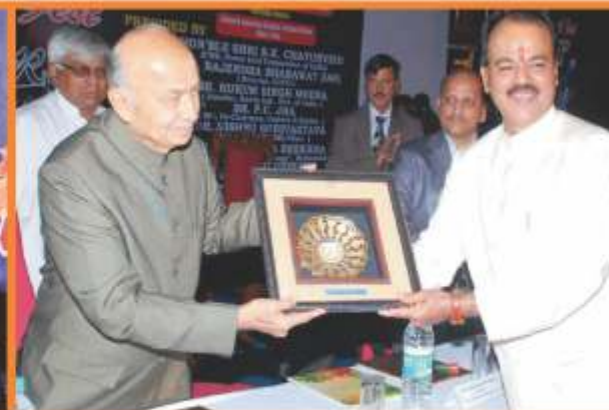
Hon'ble President of the Trust Presenting Memento to Shri Sushil Kumar Shinde, then Hon'ble Union Minister of power at a Function at Shankara Campus