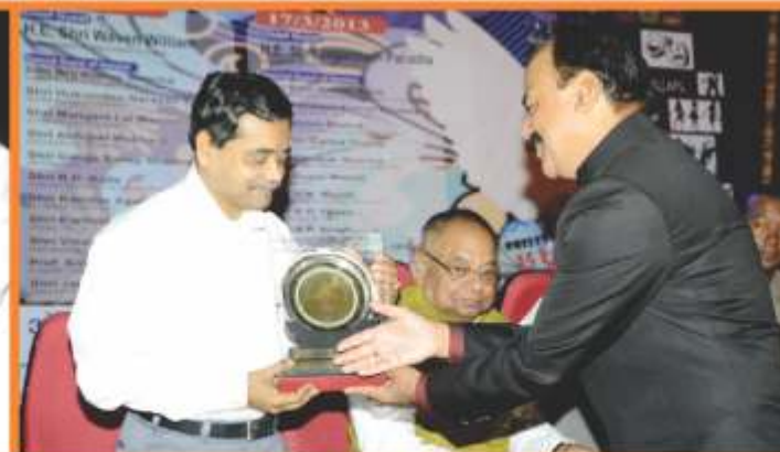
Hon'ble President of the Trust Presenting Memento to Hon'ble Shri Abhijit Mukherjee, Member of Parliament