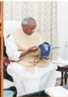
H.E. Shri Kalyan Singh with Hon'ble President of the Trust