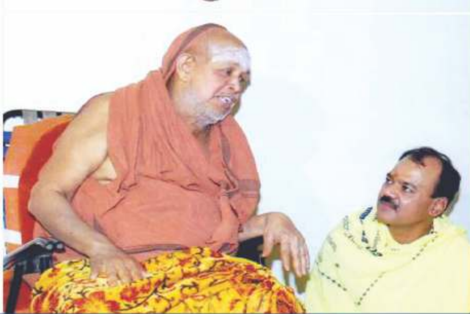
-HIS HOLINESS JAGAT GURU SHANKARACHARYA JI OF KANCHIPURAM

R ight Education should make us know that "God is the truth". Knowledge must fill one with good qualities through with one alone can realize the truth, that is God. Therefore, the goal of Knowledge is the understanding of the Ultimate Truth. The first fruit of education must be humanity and self-control.