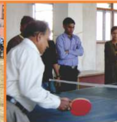
Table Tennis Match during the National Level Youth Fest SITE-2015