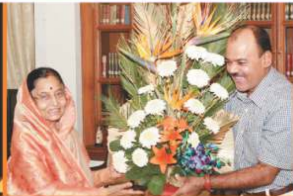
Hon'ble President of the Trust Presenting bouquet to then President of India H.E. Shrimati Pratibha Devi Singh Patil