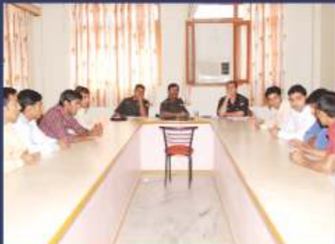
Placement Interview by Indian Army