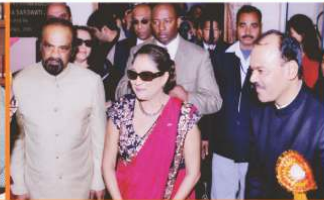
Her Excellency Hon'ble Prime Minister of Trinidad & Tobago, Smt. Kamla Persad Bissessar during PGDM Convocation Ceremony