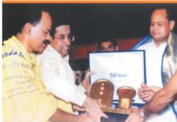
Hon'ble President of the Trust Presenting Memento to Shri Ashok Gehlot, then Hon'ble Chief Minister of Rajasthan