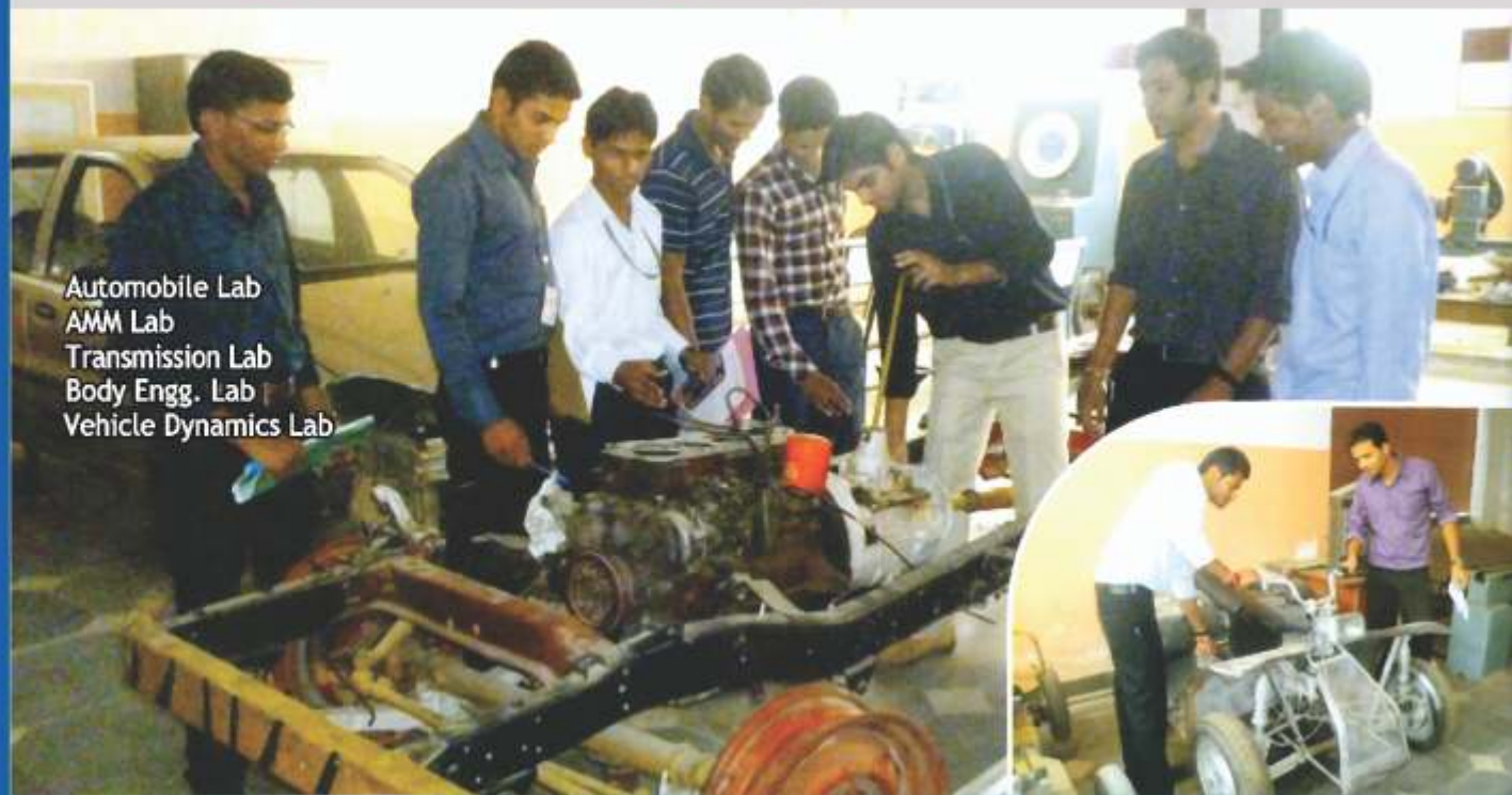
Automobile Lab AMM Lab Transmission Lab Body Engg. Lab Vehicle Dynamics Lab

Automobile Engineering is a branch of engineering which deals with basics of automobile and industry as there is an increasing potential in this field.