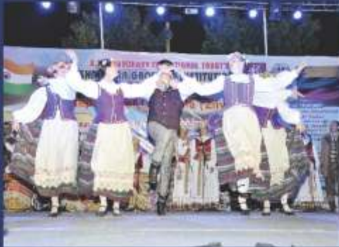
Lithuania Dance Group "Zilvitis" performing at Shankara